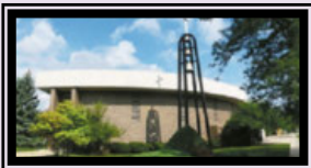
St. Barbara Church 4000 Prairie Avenue Brookfield, IL 60513

Parish Office 4008 Prairie Avenue Brookfield, IL 60513 708.485.2900 www.hgaparish.org