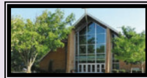
St. Louise de Marillac Church 30 th Street & Raymond Avenue La Grange Park, IL 60526

Parish Office 4008 Prairie Avenue Brookfield, IL 60513 708.485.2900 www.hgaparish.org