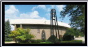
St. Barbara Church 4000 Prairie Avenue Brookfield, IL 60513

Parish Office 4008 Prairie Avenue Brookfield, IL 60513 708.485.2900 www.hgaparish.org