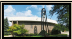
St. Barbara Church 4000 Prairie Avenue Brookfield, IL 60513

Parish Office 4008 Prairie Avenue Brookfield, IL 60513 708 485-2900 hgaparish.org