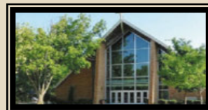
St. Louise de Marillac Church 1144 Harrison Avenue La Grange Park, IL 60526

Parish Office 4008 Prairie Avenue Brookfield, IL 60513 708 485-2900 hgaparish.org