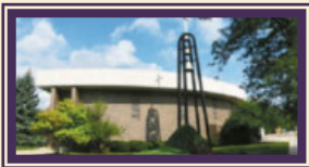
St. Barbara Church 4000 Prairie Avenue Brookfield, IL 60513

Parish Office 4008 Prairie Avenue Brookfield, IL 60513 708 485-2900 hgaparish.org