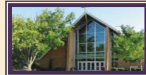
St. Louise de Marillac Church 1144 Harrison Avenue La Grange Park, IL 60526

Parish Office 4008 Prairie Avenue Brookfield, IL 60513 708 485-2900 hgaparish.org