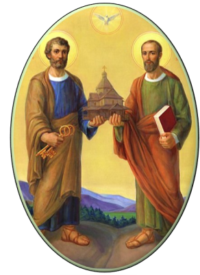
St. Peter & Paul